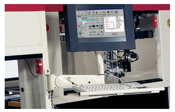
Touchscreen monitor and keyboard user interface