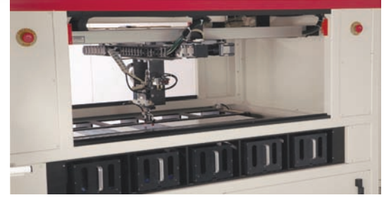
Tested cells are sorted into output bins according to the cell's electrical performance.