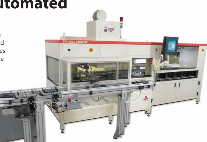
Sorts PV cells according to electrical performance